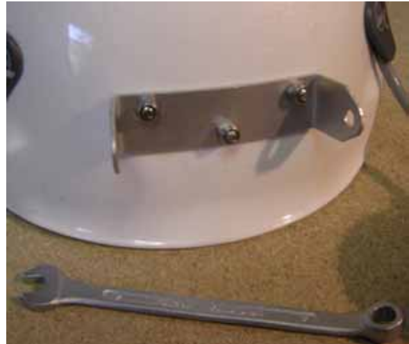
Mounted lamp holder