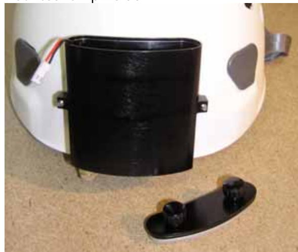
Mounted battery case