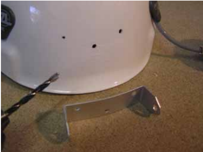
Prepared drillings for the lamp holder

We recommend leading the lamp cable on the inner side of the helmet. Alternatively of course you can use the two provided plastic fixations in order to fasten the cable outside to the edge of helmet.